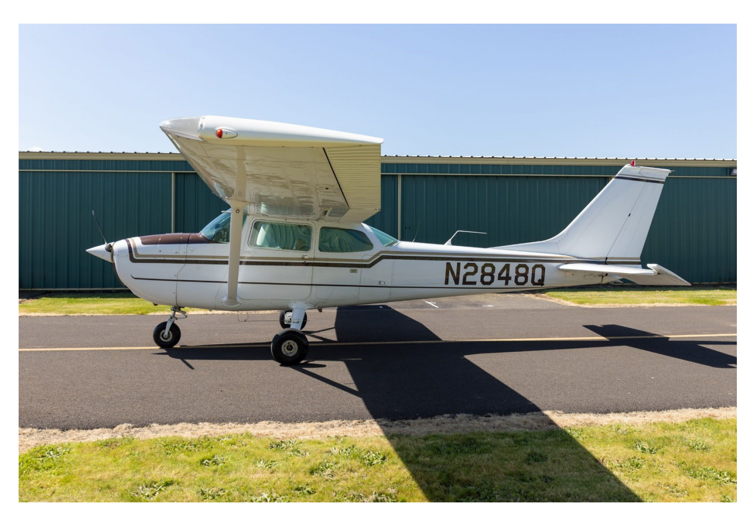
IFR Cessna 172. Great time builder. 6269.14TT, 1237.68 SFRM, Equipped with a Garmin GNX 375 GPS/ADS-B In and Out, King KX155 Nav/Com, King KX125 Nav/Com, 4 Place Intercom. Tuned Exhaust System, New Interior 2013 with Leather Seats, Rosen Visors, Door Stewards, LED Wingtip Lights. Current Annual, Complete Logs, always hangared.